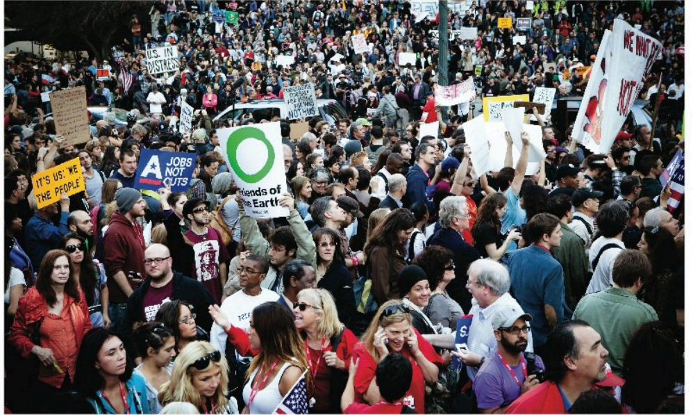
NEW YORK TURNS OUT TO OCCUPY WALL STREET: Labor unions and student walkouts brought tens of thousands to Foley Square on Oct. 5. After dusk, crowds filled lower Manhattan around Zuccotti Park, re-named Liberty Square by the occupation. Despite high spirits among the protesters and no incidents of violence or vandalism, NYPD officers arrested numerous people. Pepper spray and batons were also deployed.

Something else this movement is doing right: You have commi-